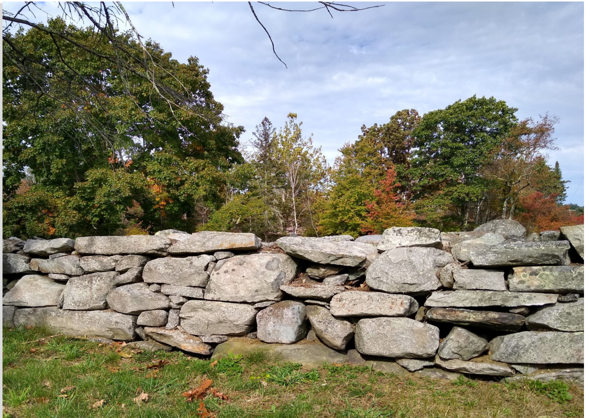
Photo: Stone Wall at Old Town Hall Complex