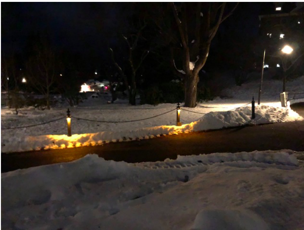
Walkway behind Wright Hall, designed by an Engineering class