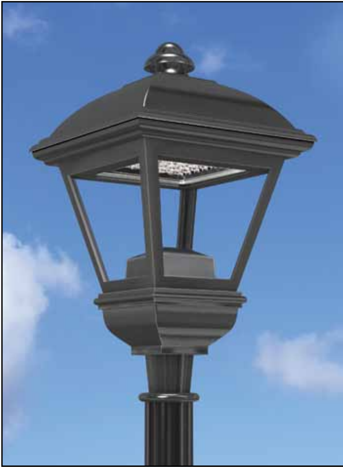
1 Model: COL

Clear Flat Glass Lens - This design features excellent fixture brightness control for either VLED or HID optical systems. It provides sharp cutoff optics for dark sky or light trespass requirements.